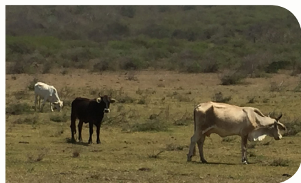
Punta Mita's first residents