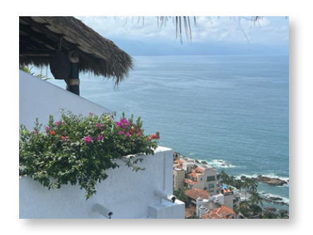
Some of the flowers took the brunt of Lidia's winds, but they are making a terrific comeback!