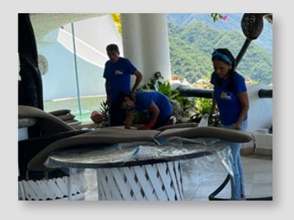
Cushions were cleaned.