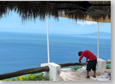
Guayabillo Wood railings maintenance from Villa 2 to Penthouse