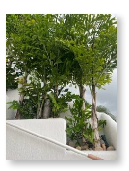
The new palms along the stairway.