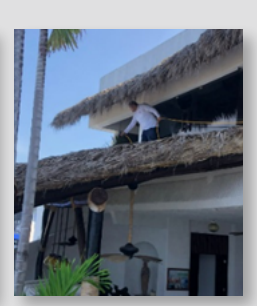
Palapas were treated with fire retardant.