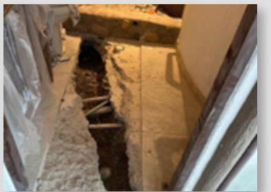
Major repairs to the A.C. condensation line and electrical in the Junior Bedroom. Some VERY serious work (major "surgery" involved to the walls and floor! Similar repairs were also done in Villas 3 and 5.