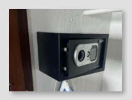
Safes in each bedroom were relocated to a higher, more convenient location.