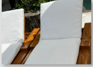
New chaise covers.