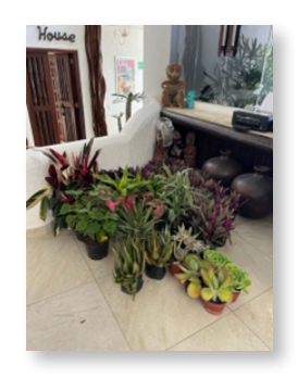
Some of the new plantings done in 2023 SMP.

The complete renovation of the landscaping conducted during the September Maintenance Period (SMP) in 2022 continues to thrive! And some further improvements were made during the 2023 SMP. Hurricane Lidia did do a "haircut" on some of the plants, but overall, the new landscaping is maturing well. Here are some pictures of how the landscaping is developing: