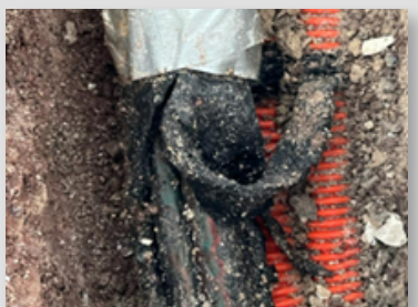
Major repairs to the AC condensate lines in the Junior Bedroom. Similar to repairs completed in Villas 6 and 5.