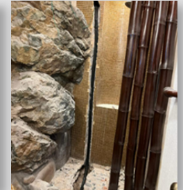
Extensive work required to repair the AC condensate lines in the Junior Bedroom. Wall and floor had to be dug-up! This work will be required in Villas 2, 7, 8 & 9 next September.