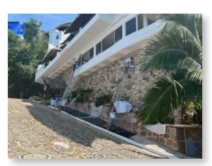
Palms at the front of Ocho Cascadas and even the lower street entrance looking good.