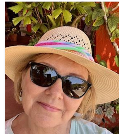
The former Luisa

Please reach out to me or Dave for the list of weeks for sale/resale, or the upcoming available weeks for rent or a bonus week use.